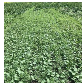
Figure 3: Right: kochia competition in canola. July 2019. Saltcoats, SK.