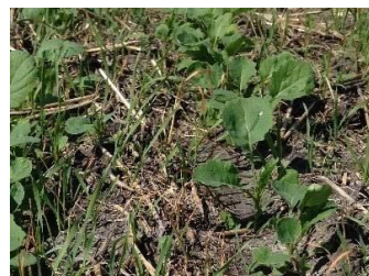
Figure 2: Left: Grassy weed pressure in herbicide tolerant canola near the end of the CWFP.